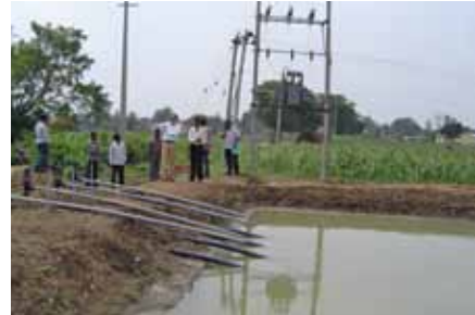
Photos: A new and efficient irrigation scheme inaugurated using less water for irrigation than before.

At the request of Karnataka water resource officials, WRG will also assess issues related to water use in the industrial and urban sectors. Demand for water is growing for power production, iron and steelmaking, the pulp and paper industry, for sugar processing and for mining and refining activities. Still more demand is likely to come from emerging industries including information technology, automobile production and biotechnology and engineering industries. WRG will set out how best practices from other sectors might be applied in developing a strategy that takes in the needs of all water users.